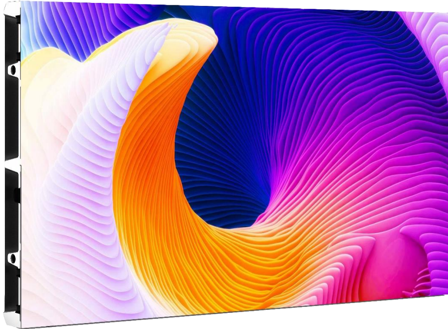
MW7809-FI-CF COB LED Display